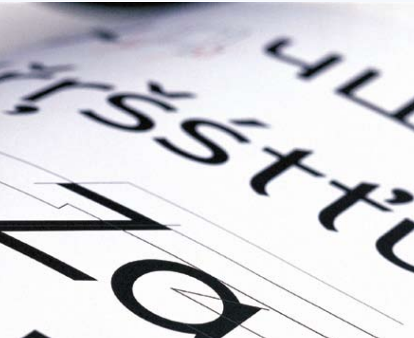
Custom typeface design for Opel