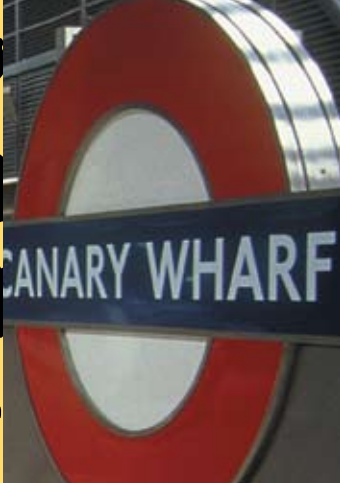
Custom typeface design for Transport for London